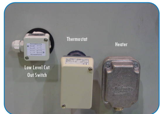
External view water basin

All heaters and controls are furnished with weather-tight enclosures and are factory-mounted ready for field wiring. (except on S3000E, FXVT and CXV-D: shipped loose)